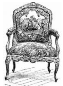
LOUIS XV, CHAIR, 1745 - 1750 Illustrated with French text: L'Esprit de la France